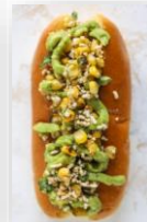
GRILLED MEXICAN STREET CORN DOG