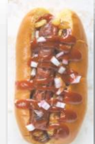
THE HAWAIIAN DOG