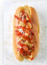
CARAMELIZED ONION AND CHEDDAR DOG